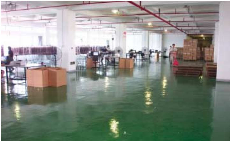
(Picture1-- Overview of Working Area)

In simple, we collect the goods from suppliers based on client's inbound timetable. And then process inbound operation in warehouse, including quantity confirm, QC inspection, and adding arrival through Seko' system. After confirming the goods in system, UK will know that the goods'