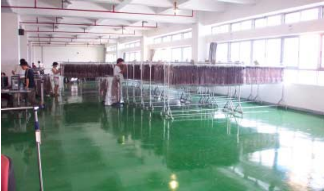
(Picture2 -- Picking the goods)

arrival. Then we pick & pack goods by stores' orders based on system allocation from UK. At last, we issue related customs declaration documentation and ship the required goods out.