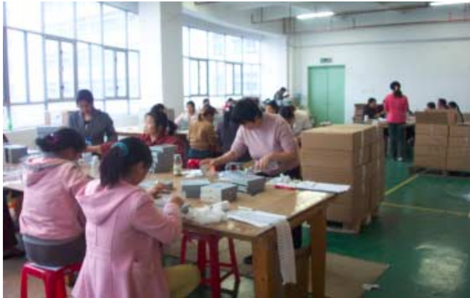
(Picture 3 --Working area)