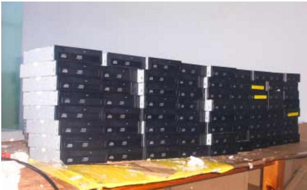
(Picture2-- CD-ROMS wait for processing)